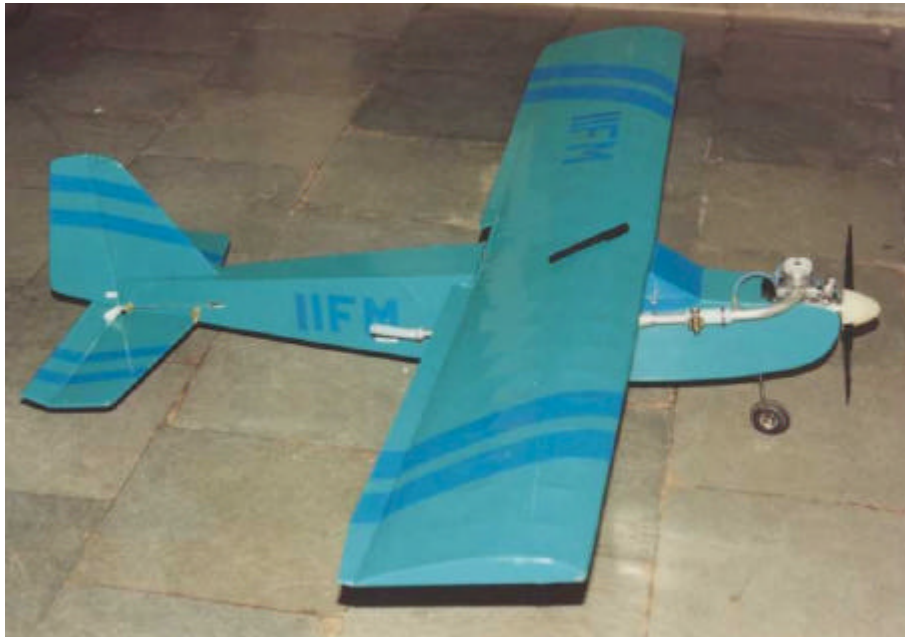
Figure 2: Model Aircraft developed at IIFM for taking low cost pictures