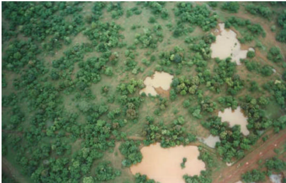
Figure 3: A Picture taken from the model craft showing individual trees