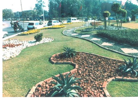
Landscaped traffic roundabouts