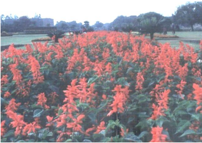
A view of Terraced garden